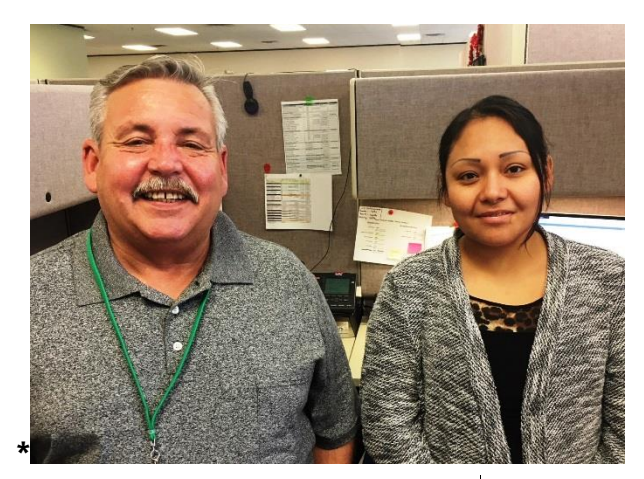
NEW* Hunter & Boater Education Administrative Assistants