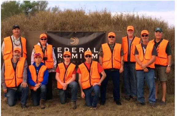
2016 Heritage Hunt Participants

For the last four years, Texas has hosted the IHEA-USA Heritage Hunt (formerly the "Dream Hunt") at the Hixon Land & Cattle Ranch near Cotulla, Texas. (See 2017 Heritage Hunt Article within this national <u>IHEA-USA Journal!)</u>