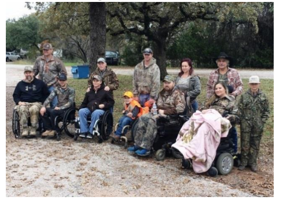
Inks Lake State Park December 2016