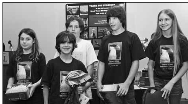
Houston Audubon Accipiters

Prizes: Endangered and Threatened Animals of Texas (donated by TPWD)