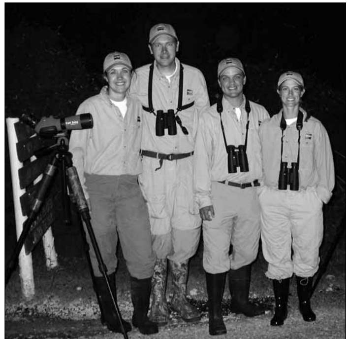
Zeiss Optics NOCA PIPL

Prizes: Texas Wildlife Viewing Guides (donated by TPWD)