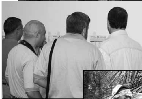
Cumulative checklists at Awards Brunch