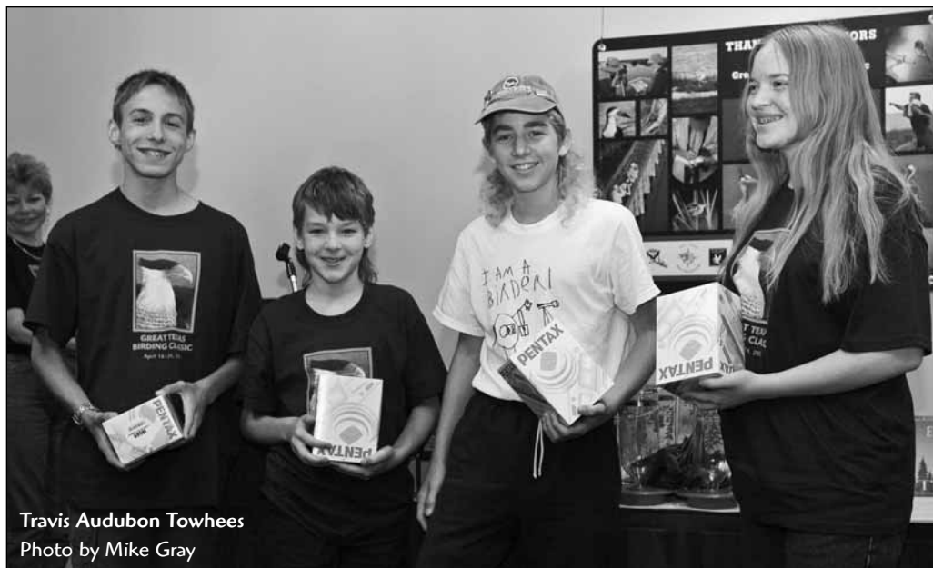
Travis Audubon Towhees

The youth tournaments continue to attract new birders every year! A special thank you goes out to all of the mentors, teachers, parents, scout leaders and sponsors for taking the time to help guide these young people into the field and educate them about birds and conservation along the Texas coast.