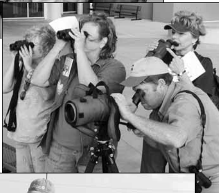
Cat House Birders