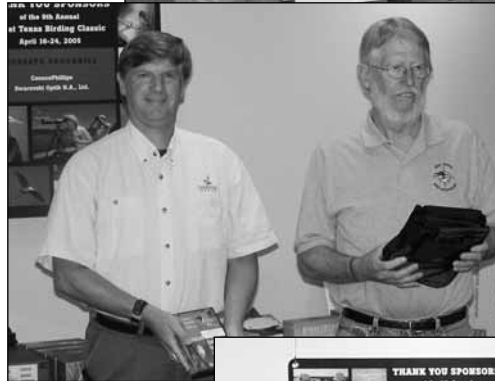
Swarovski/Gulf Coast Bird Observatory Roadside Hawks

Prizes: Thayer Software Birds of North America (donated by Thayer Birding Software), and Pájaro Waist Bags (donated by Pájaro)