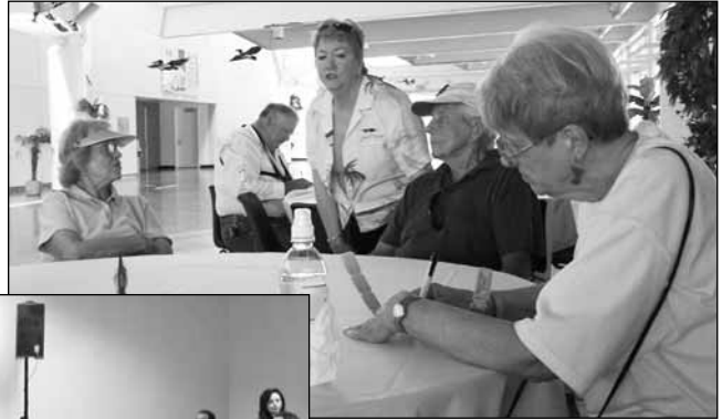
Community Birding Day raffle