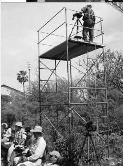
The Brazosport Birders