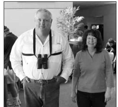
Three Blind Birders

Most Indigo Buntings – Cat House Birders with 3 individual birds