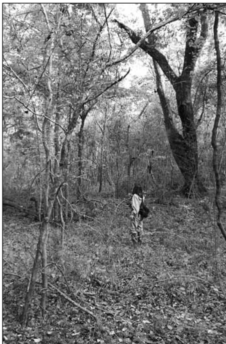
Carolyn Raizes Davis Bird Sanctuary