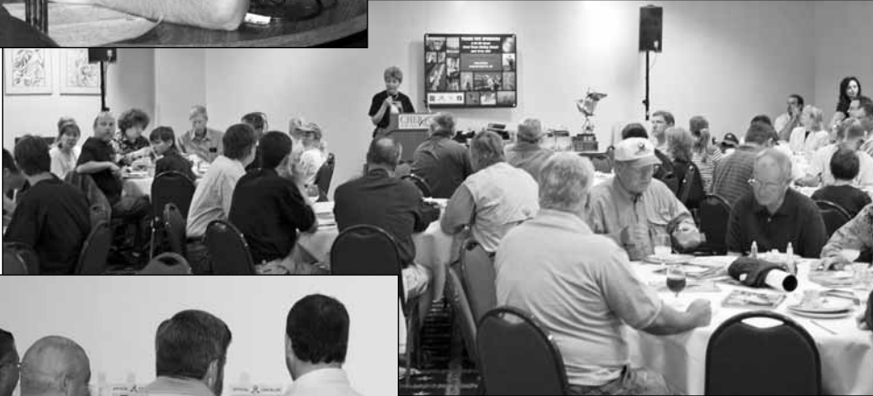
Awards Brunch