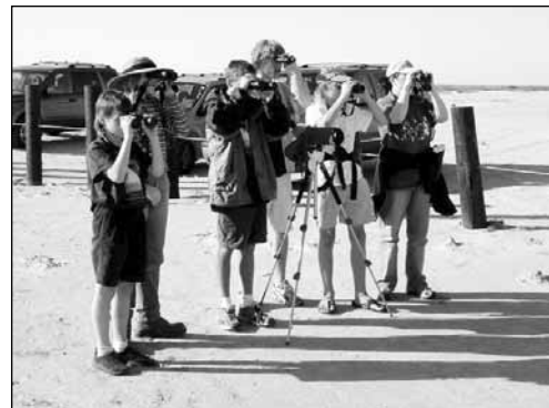
Travis Audubon Towhees

Prizes: Pentax IQZoom 105S Cameras (donated by Pentax Imaging Company)