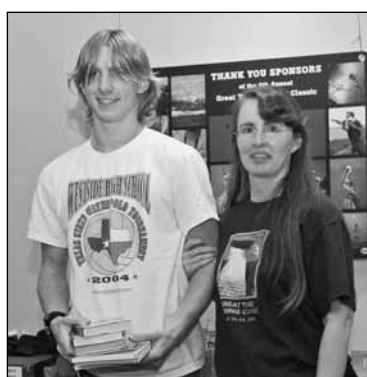
Golden Eagles