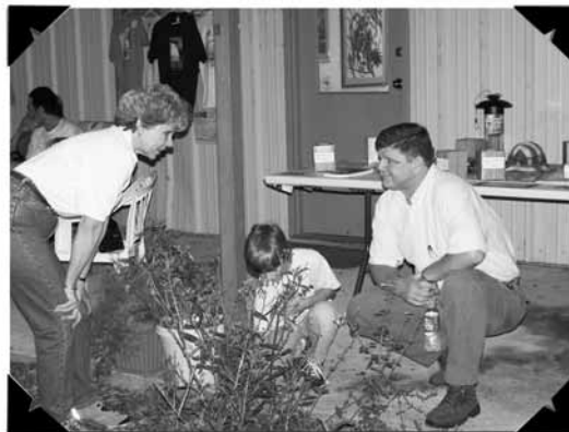
Upper Coast registration