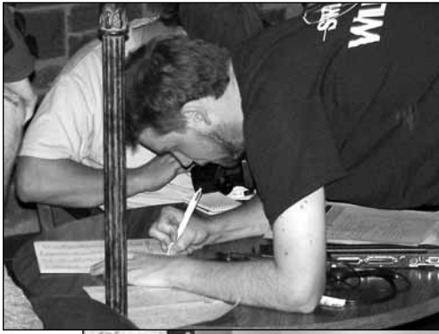
Final checklist dropoff