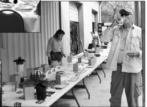
Upper Coast registration and silent auction