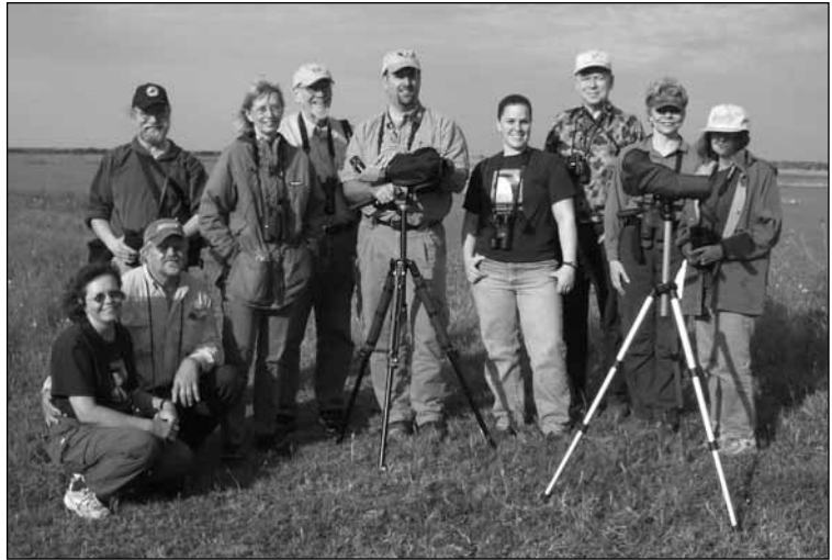
GTBC 2005 judges and staff