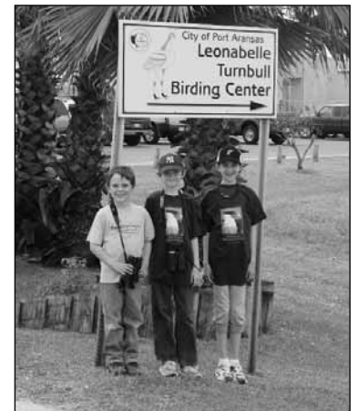
Travis Audubon Tanagers

Prizes: Texas Wildlife Viewing Guide (donated by TPWD)