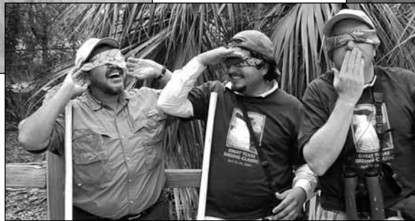
Hear no evil, see no evil, speak no evil