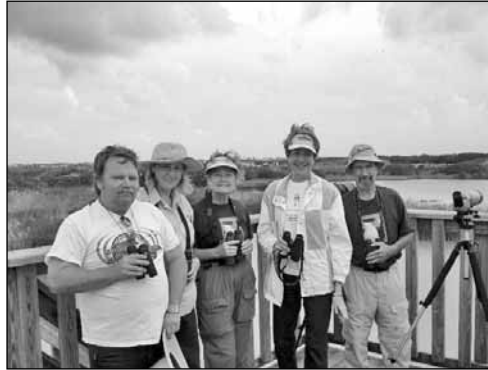
Port Aransas Spoonbills