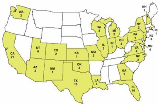
FIGURE 2. States in the USA where we detected dealers of amphibians and reptiles with commercial Internet sites. Not shown are 13 international dealers that were willing to sell and ship to customers in Texas, USA.

Informal visits to large chain pet stores revealed that the lizard is available through these venues which could account for their import in such large numbers. An