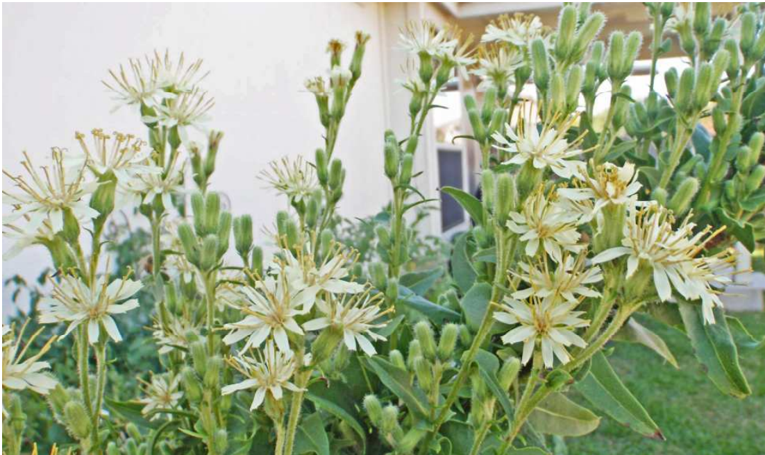
Figure 1. Prenanthes aspera (Singhurst 18337, BAYLU), garden grown from collection in Bowie County.