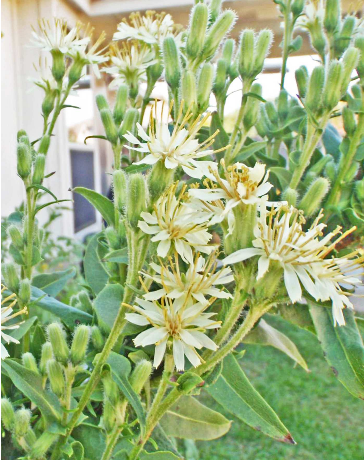
Figure 2. Prenanthes aspera (Singhurst 18337, BAYLU). Part of the photo in Figure 1.