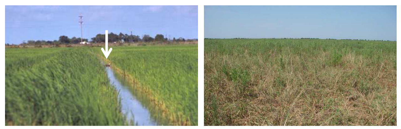
Active growing rice (left) with a mottled duck swimming (center of image) beside a rice levee and a fallow rice field (right) colonized by grasses and forbs. Lands dedicated for rice production on the Texas Coast can provide habitat of moderate quality for breeding mottled ducks with some changes to existing land use practices.

<u>Rice Cultivation</u> – Rice production on the Texas Coast generally follows a 2- to 3-year rotation. A field is cultivated in rice for a single growing season and then is left unplanted for the following 1 to 2 growing seasons. The arrangement of flooded, growing rice fields and dry fallow fields provide an opportunity for managing breeding habitat for mottled ducks. Active rice fields are typically flooded April through mid-July and can provide adequate habitat for pairs and ducklings. The grasses and forbs growing in dry fallow fields can provide nesting cover of moderate quality (especially in the 2<sup>nd</sup> fallow year) as long as activities that manipulate vegetation are delayed until July. Grazing of rice fields after harvest should be delayed initially to allow for establishment of nesting cover (grasses) and then cattle should be introduced at a low stocking rate. Mottled ducks will visit flooded harvested rice fields to feed on waste rice and other weed seeds.