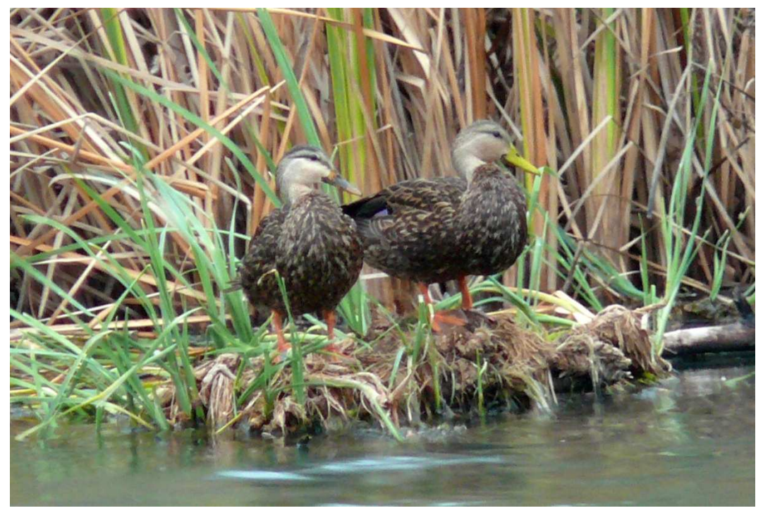
A pair of mottled ducks (female at left) loafing on a cattail hummock. Male mottled ducks are identified by a yellow to greenish-yellow bill while females have an orange bill with or without dark markings.