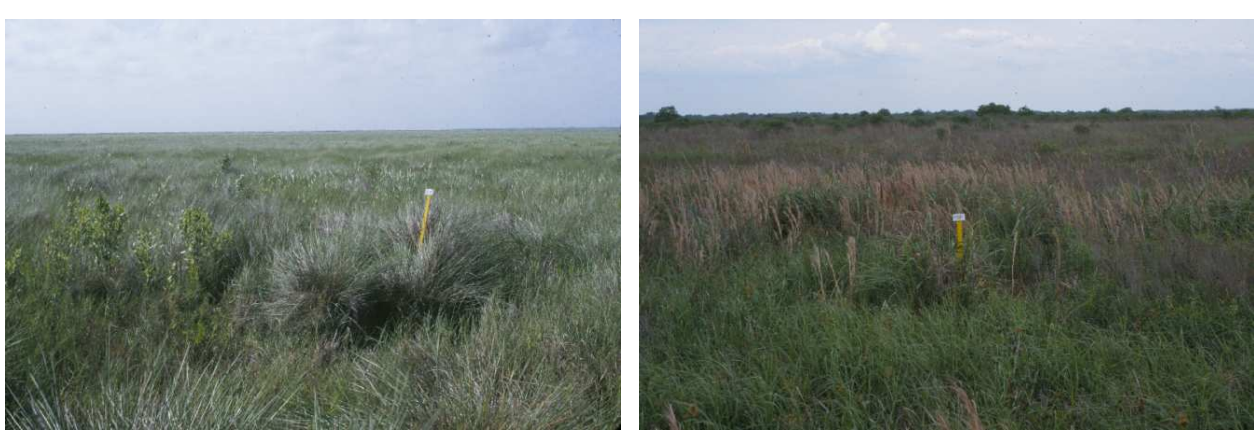
Examples of suitable nesting cover in a high marsh dominated by Gulf cordgrass (left) and a mixed-grass upland prairie (right). Note the limited amount of woody plants. The yellow stake in each picture marks the location of an actual mottled duck nest.

Features of nesting habitat in agricultural and coastal settings considered important for mottled ducks.