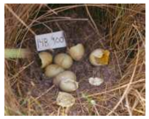
A mottled duck nest destroyed by a predator. Eggs eaten by a mammalian predator usually have yolk stains and the shells are partially or entirely crushed.

and occasionally large bullfrogs. Raccoons, skunks, ground squirrels, rat snakes and feral hogs will readily eat the eggs after finding a nest. Hawks and owls also will take adults and ducklings that are not in adequate cover. Increased rates of predation on adults, nests and ducklings are a concern because population growth is determined by the number of adults and young that survive and breed the following year. Removing predators and reducing predator encounters with mottled ducks may improve breeding production at a local scale if habitat is managed to provide optimal conditions for breeding. The following guidelines should be considered for reducing predation on adults, eggs and ducklings.