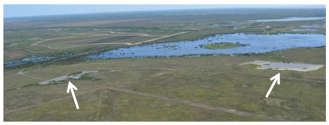
A prairie-wetland complex at Mad Island WMA consisting of small seasonal wetlands (white arrows), large semipermanent marsh and grassland nesting cover. Habitat complexes such as this are capable of satisfying habitat requirements of mottled ducks for most of the year.

Mottled ducks will select habitats based on specific characteristics, such as food type and abundance, water depth, vegetation type and density, and habitat size and placement in relation to other habitats. Habitat can be managed in such a way to improve its potential for use by mottled ducks. Providing and managing habitat for mottled ducks is an important objective for public land managers; however, public lands (state and federal) represent a small fraction of the coastal Texas landscape. Thus, effective conservation actions for mottled ducks need to include efforts on private lands as well. Coastal and agricultural tracts can be effectively managed for mottled ducks. Land tracts with the greatest potential for mottled ducks are those containing a combination of wetlands (freshwater or low-salinity marsh) and good grassland cover.