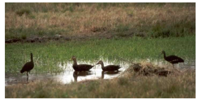
A mottled duck pair (center, male on left) and ibis in a small, shallow wetland with short emergent vegetation.

<u>Foraging</u> – Mottled ducks prefer to forage in shallow water that is 12 inches or less in stands of short emergent vegetation, beds of aquatic vegetation, and temporary sheetwater ponds. Emergent vegetation generally does not exceed 50% of wetland area. Common foods eaten include seeds, aquatic vegetation, insects and