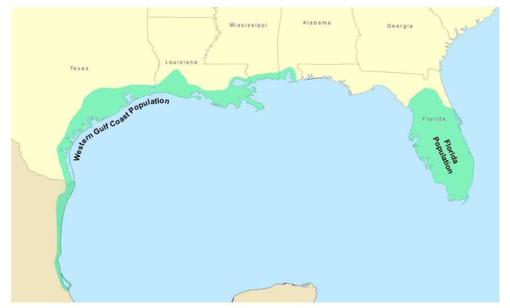
Mottled duck range (green shading) in southeast United States and northeast Mexico.

For management purposes, mottled ducks are divided into two geographic populations; Florida and the Western Gulf Coast. Banding data and genetic analyses suggest a lack of interchange or movement of mottled ducks between these two regions. The range for the Western Gulf Coast population of mottled ducks stretches from Alabama, west to Texas and continues south to Tampico, Mexico.