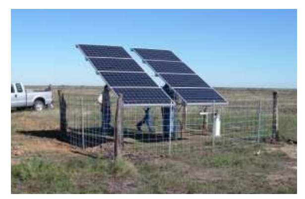
Small, solar-powered wells are ideal supplemental water projects for small wetlands (10 acres or less), as they ensure a constant water supply with few or no operating costs.

man-made impoundments offer the highest potential "rate of return" for mottled ducks. Thus, management actions that maintain water at appropriate depths (see Habitat Needs section above) from late-winter through summer will support breeding activities and, in turn, may increase mottled duck numbers. Maintaining water during the molt period of July through mid-September also should be considered as surface water can be limited at this time of year. Providing supplemental water during drought can offer significant benefits for local populations of mottled ducks.