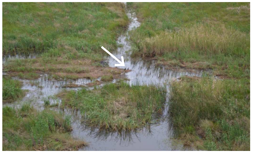
An example of spring wetland habitat selected by a mottled duck pair (on point of land in center). Notice the small size of the wetland and the presence of screening cover and raised ground for loafing. Small, seasonal wetlands like this can be just as important as larger wetlands, especially in late winter and spring when pairs seek isolated habitats before and during the onset of nesting.

<u>Pre-breeding</u> – Male and female mottled ducks will begin courtship behavior in late fall and by early winter the majority of mottled ducks have established pair bonds. During this time pairs will separate themselves from other ducks and seek small isolated wetlands or small pockets of open water in larger marsh. Pairs will select sites having qualities described above for foraging and will include features for resting and preening such as small islands, clumps of vegetation or exposed mudflats. Breeding in mottled ducks is influenced by the availability of suitable wetlands in late winter and spring. Without adequate surface water in wetlands during this period, mottled ducks may (1) delay breeding until wetland conditions improve; (2) search for other sites with better wetland conditions; or (3) forego breeding for the year when suitable wetlands are not available.