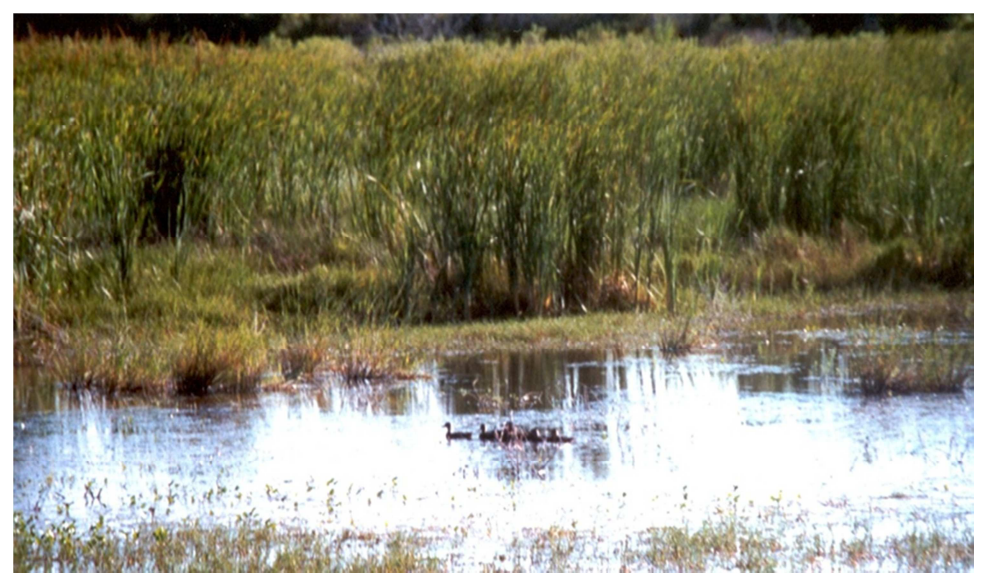
A female mottled duck and her nearly fledged ducklings in a semi-permanent wetland. Note the presence of sparse, short vegetation in the middle and around the edge of the open water, and the dense growth of grass and cattails (background) providing escape cover.

from the water surface. Cover should be nearby in the form emergent vegetation at a density that does not hinder mobility of ducklings.