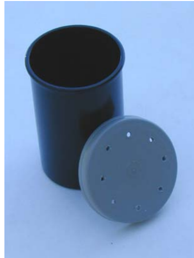
Figure 6: Bait stations can be created by drilling 1/16 th inch holes in the lids of small containers.

There are many things that can be done to help harvester ant populations to increase. If you have harvester ants on your property, appreciate them and do what you can to ensure the continued survival of this fascinating member of our native ecosystems.