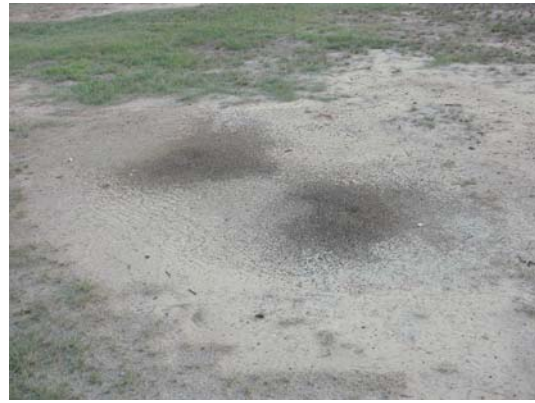
Figure 1: Two Harvester Ant mounds side by side. Notice the absence of plant material around the mounds.

Though there are harvester species that prefer wooded areas and/or