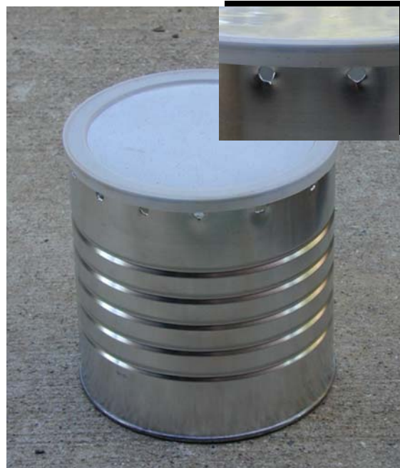
Figure 4: You can make a feeding station by punching 3/16" holes into a coffee can just beneath the rim of the lid.

To take full advantage of the harvester's behavior, remember to feed colonies at sunrise so that the food is out the shortest amount of time before the patrollers find it.