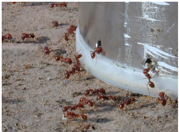
Harvester ants working diligently to harvest seed from a coffee-can feeder.