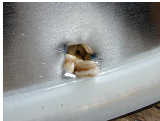
Figure 5: As you turn the feeder over, the seeds will become available to the harvesters through the holes you created.