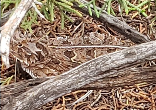
Texas horned lizard

The City Nature Challenge is a global, city-scale BioBlitz event that frames an urban biodiversity survey as a friendly competition between cities.