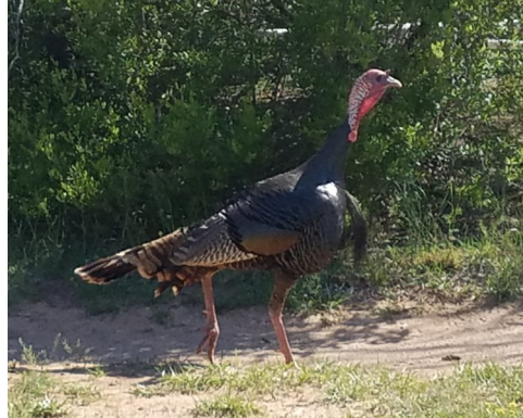
Wild Turkey , Panhandlegal, iNaturalist, CCBY-NC