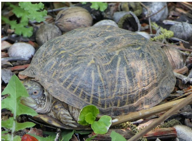
Ornate box turtle , bennyep, iNaturalist, CCBY-NC