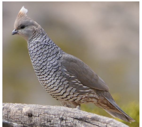
Scaled Quail

American Kestrel, Falco sparverius American White Pelican, Pelecanus erythrorhynchos Burrowing Owl, Athene cunicularia Desert Box Turtle, Terrapene ornata luteola Gray-checked Whiptail, Aspidoscelis tessellatus Green Heron, Butorides virescens Harris's Hawk, Parabuteo unicinctus Little Blue Heron, Egretta caerulea Ornate Box Turtle, Terrapene ornata Rufous-crowned Sparrow, Aimophila ruficeps Scaled Quail, Callipepla squamata Snowy Egret, Egretta thula Sonoran Bumble Bee, Bombus sonorus Summer Tanager, Piranga rubra Swainson's Hawk, Buteo swainsoni Texas Antelope Squirrel, Ammospermophilus interpres White-faced Ibis, Plegadis chihi