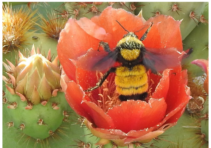
Sonoran bumble bee

The City Nature Challenge is organized by the Natural History Museum of Los Angeles County and the California Academy of Sciences. More information at citynaturechallenge.org