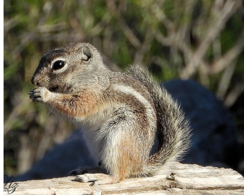
Texas Antelope Squirrel