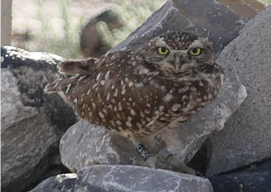
Burrowing Owl

The City Nature Challenge is a global, city-scale BioBlitz event that frames an urban biodiversity survey as a friendly competition between cities.