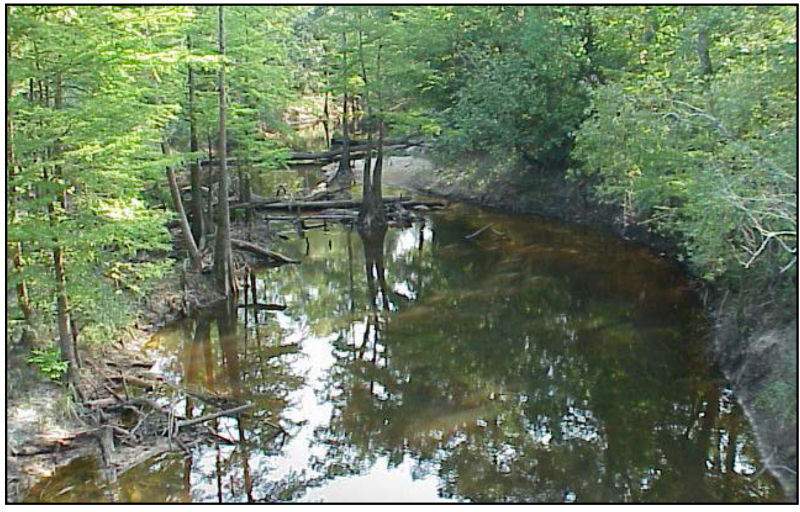
Figure 18. Beech Creek north of Gore Store Road/FM 3063 in Hardin County (8/15/01).