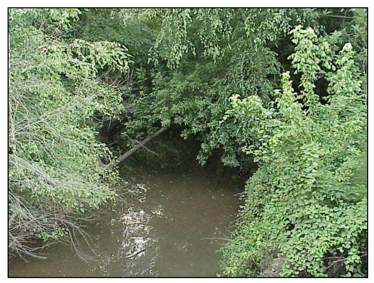
Figure 54. Sandy Creek north of FM 2913 in Shelby County (8/13/01).