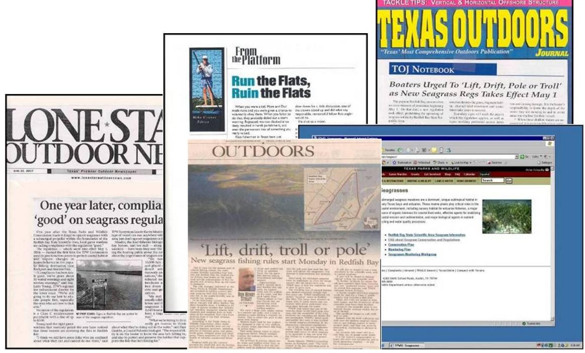
Figure 4.1. Various media materials for educating the public about the importance of Texas seagrasses.

Strategy I.2 outlines ways to inform the general public by using various media types such as press releases, radio announcements, media events, educational videos, and websites. Except for the websites, these activities are ongoing and opportunistic, depending on project completions, time of year, funding availability. The websites are maintained continuously, one by The Nature Conservancy dedicated specifically to seagrasses and one by Texas Parks and Wildlife Department, hosting a webpage with links to the Seagrass Conservation Plan for Texas, Seagrass Monitoring Plan, and information about the Seagrass Monitoring Workgroup. Two other Actions under this strategy in the 1999 Seagrass Education Plan have been modified to have more realistic goals, such as eliminating inserts with voter registrations and adding information in with hunting and fishing license brochures.