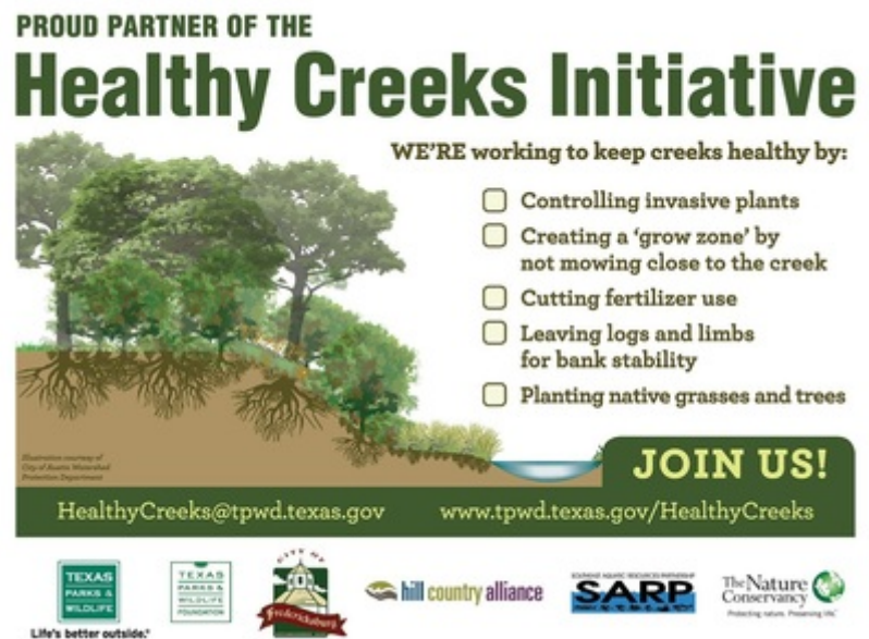
Healthy Creeks Initiative Yard Sign

Starting next Wednesday and Thursday (March 21-22), we'll be delivering yard signs to landowner partners. We hope that you'll display the sign to show your proud participation in the Healthy Creeks Initiative and to help spread the word to others. Use a permanent marker to check off the boxes on the sign to share what you're doing to help keep our Hill Country creeks and rivers healthy!