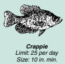
Crappie Limit: 25 per day Size: 10 in. min.