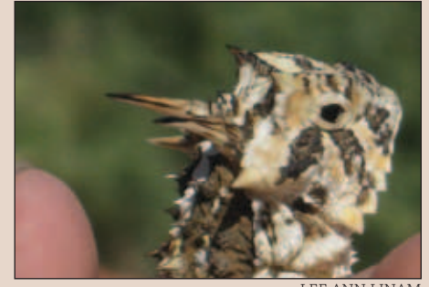
LEE ANN LINAI

Three horned lizard species call Texas home, with the most widespread being the Texas Horned Lizard, or the familiar "horny toad." The geographic range of these species can overlap in West Texas, but they can each be readily distinguished from each other by the following characteristics.