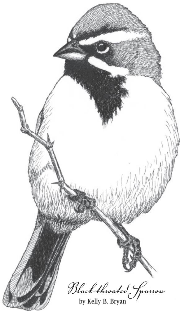
Black-throated Sparrow