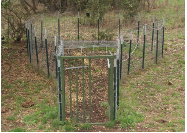
A typical corral trap made from cattle panels and T-posts.

one time. If used to target large sounders, those that are not successfully trapped may develop learned behavior which makes them more difficult to trap in the future (68).