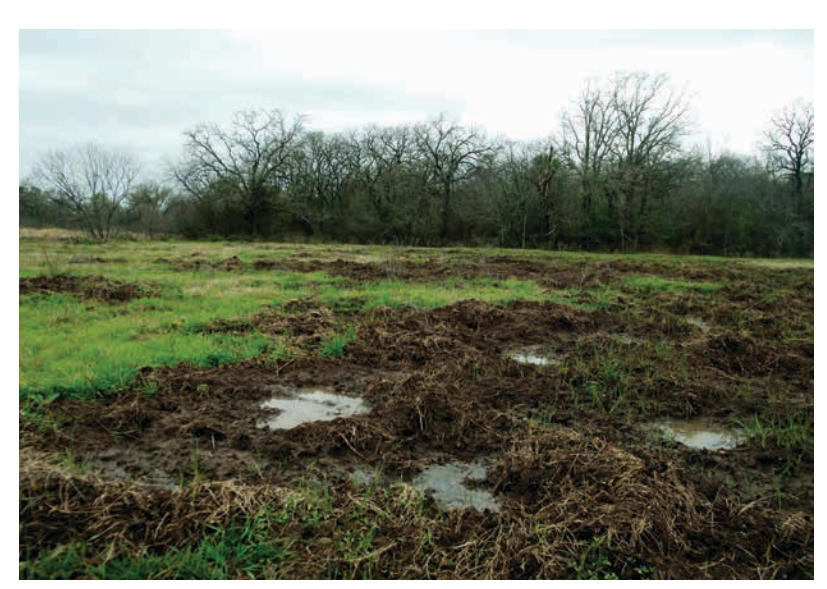
Damage to soil and vegetation caused by wild pig rooting.

Wild pigs have been listed as one of the top 100 worst exotic invasive species in the world (44). In 2007, researchers estimated that each wild pig carried an associated (damage plus control) cost of $300 per year, and at an estimated 5 million wild pigs in the population at the time, Americans spent over $1.5 billion annually in damages and control costs (45). Assuming that the cost-per-wild pig estimate has remained constant, the annual costs associated with wild pigs in the United States are likely closer to $2.1 billion today (10, 11, 45).