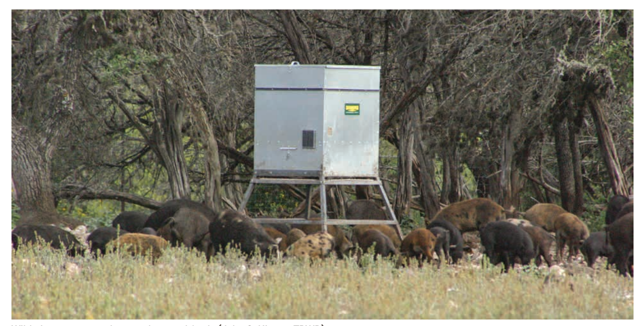
Wild pigs congregated at supplemental feed.

Some states which historically did not allow recreational hunting of wild pigs have established statewide hunting programs in an effort to solicit assistance from the public in controlling wild pig populations. Even though the intentions were good, these statewide hunting programs have sometimes resulted in population increases and rapid range expansions (15, 83, 84). Popularity of wild pigs as a game species coupled with economic incentives generated by trophy hunting industries has resulted in the human-mediated transportation of wild pigs (illegal in Texas) to areas previously not populated by wild pigs (84-86). For example, Tennessee implemented a statewide hunting program in 1999, and by 2011 wild pig populations expanded from 6 to 70 counties (84). Similarly, in 1956 when wild pigs were designated a game animal in California, their range was limited to just a few coastal counties. By 1999, however, they had spread to 56 of the state's 58 counties (83, 85). One scientific