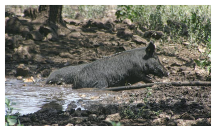
Wild pig wallowing in a pond.

it tends to increase the nutrient concentration and total suspended solids in nearby waters due to erosion (48, 50). Wild pigs also directly contribute fecal coliforms into water sources, increase sedimentation and turbidity, alter pH levels, and reduce oxygen levels (51, 52). Such activities lead to an overall reduction in water quality and degradation of aquatic habitats. Impacts from wild pigs are positively correlated with population density and vary in severity among ecosystems. Native habitat degrada-