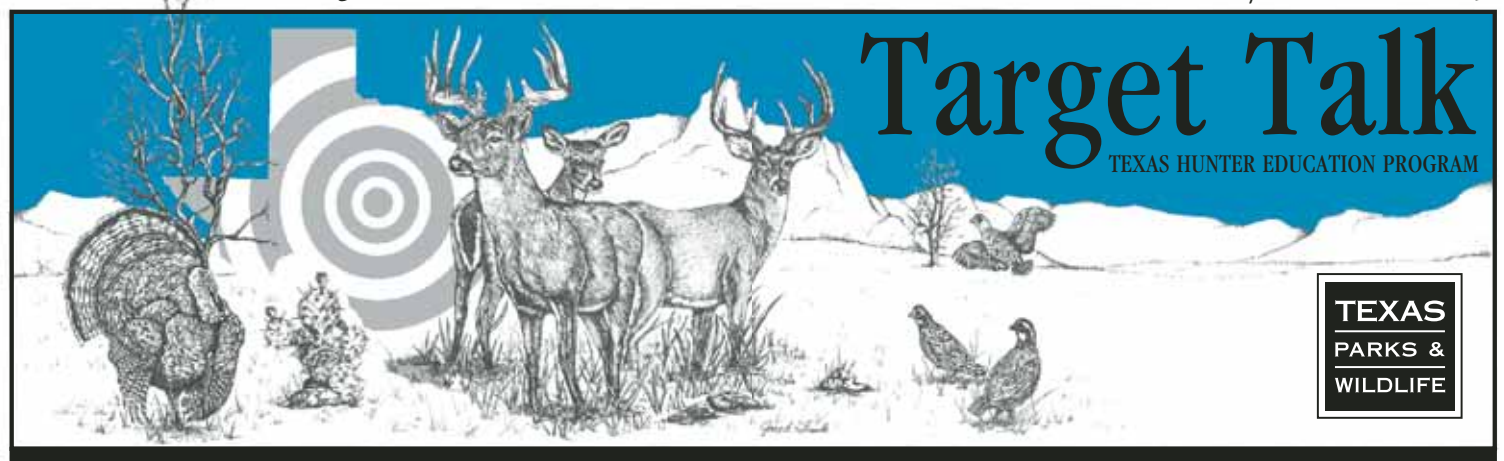
TPWD Mission: To manage and conserve the natural and cultural resources of Texas and to provide hunting, fishing and outdoor recreation opportunities for the use and enjoyment of present and future generations.