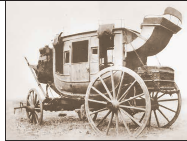
Butterfield Stage with an extra backseat, which was unusual for this type of conveyance between St. Louis and San Diego.

Even after the arrival of the Spanish, Hueco Tanks remained a landmark for indigenous people and traveling newcomers. Within its rock enclosures, many satisfied their thirst and