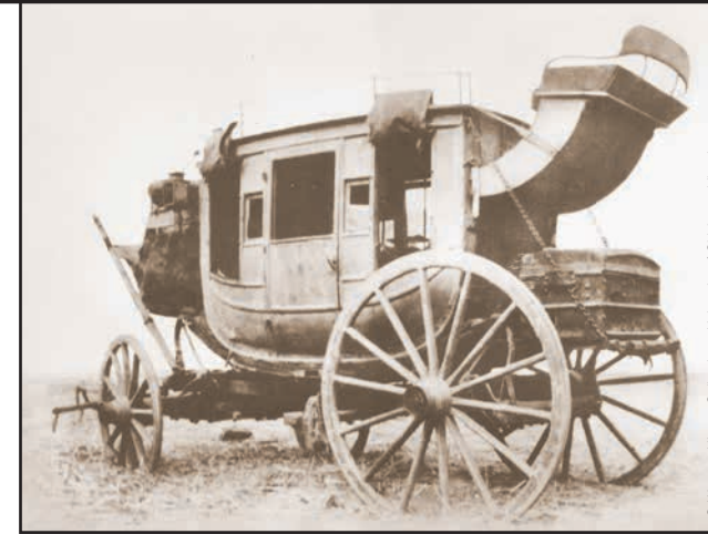
Butterfield Stage with an extra backseat, which was unusual for this type of conveyance between St. Louis and San Diego.

Even after the arrival of the Spanish, Hueco Tanks remained a landmark for indigenous people and traveling newcomers. Within its rock enclosures, many satisfied their thirst and