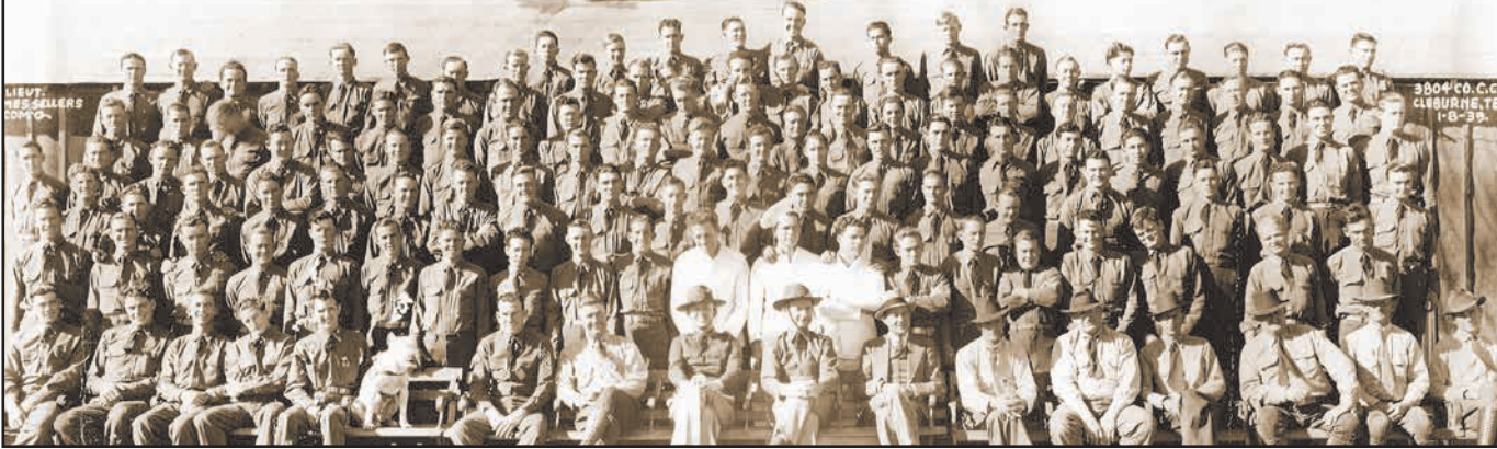
Civilian Conservation Corps Company 3804 in 1939