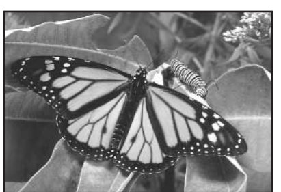
© E.R. Degginger/Color-Pic. Inc. Monarch butterfly photo from www.enature.com