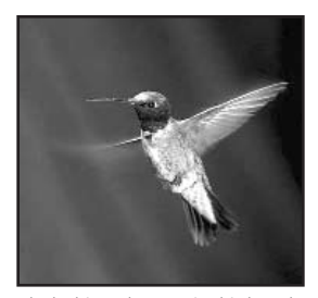
Black-chinned Hummingbird, male

These tips should help. Remember that identification over the internet or through the mail is always much easier if the description is accompanied by a photo.