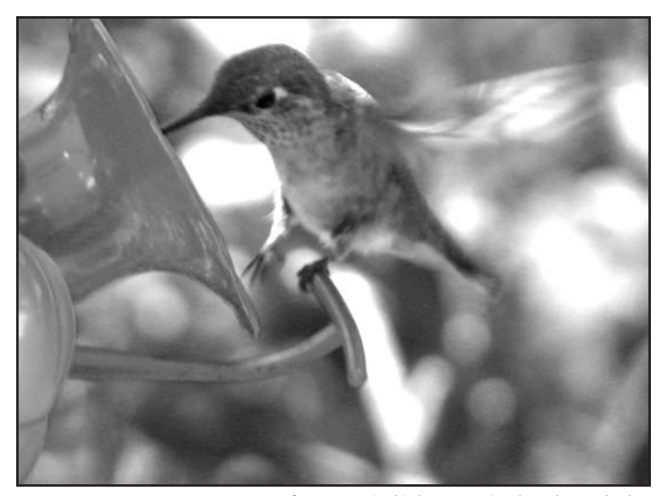
Immature Rufous Hummingbird, Fort Davis.

And you had your feeders active all along. What better evidence that feeders do not keep the birds from migrating?