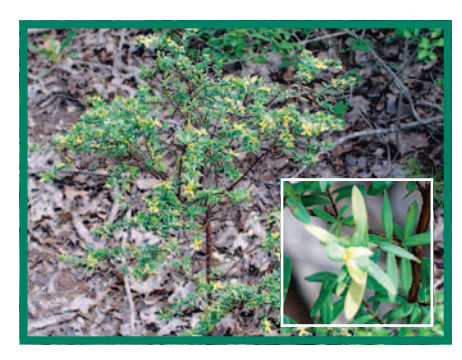
St. Andrew's Cross Ascyrum hypercoides

vine; green bark with green recurved "cathook" prickles; smooth shiny green 3-lobed leaves, can be variable