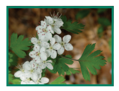
Hawthorn species Crataegus spp.

small tree; many species; twigs usually with slender thorns; scaly gray outer bark, reddish-brown inner bark; spring white flowers