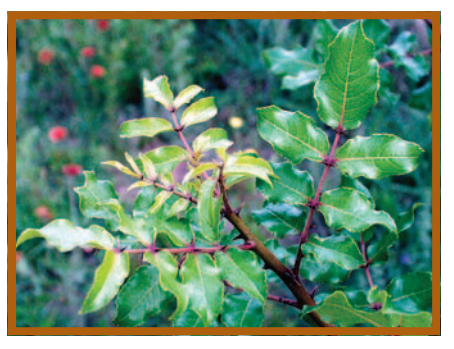
Hercules Club/Prickly Ash Zanthoxylum clava-hercules

evergreen tree; reddish-brown bark flakes off in strips; reddish-brown twigs; bluish berries