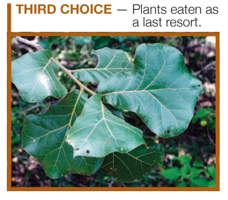
Blackjack Oak Quercus marilandica

shrub or tree; small evergreen leaves; gray twigs; shiny red berries in fall and winter