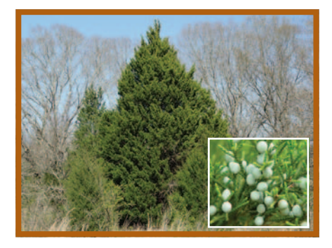
Eastern Red Cedar Juniperus virginiana

small shrub with shreddy reddish bark; leaves opposite; coral red to pink berries in fall