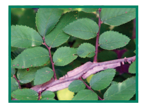
Cedar Elm Ulmus crassifolia

vine; green bark with numerous black needle-like prickles; leaves shiny green above, paler below