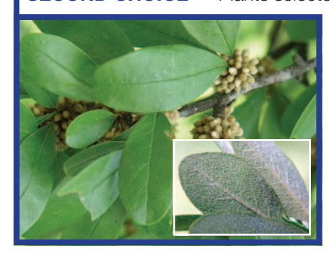
Bumelia Bumelia lanuginosa

small tree; also called woolybucket bumelia and gum elastic; leaves shiny green above, fuzzy or wooly below; thorns