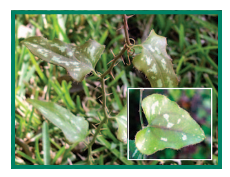
Sawtooth Greenbriar/'Catbriar' Smilax bona-nox

shrub or small tree; olive-green leaf rough above, fuzzy below; reddish stems; fall berries; moist soils