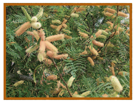
Honey Mesquite Prosopis glandulosa

rounded shrub or small tree; also called toothache tree; reddish thorns and leaf stems; opposite leaves