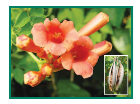
Trumpet Creeper Campsis radicans

shrub 2-5m; called Eve's Necklace; fuzzy leaves; fragrant pink bonnetshaped blooms; black-beaded bean