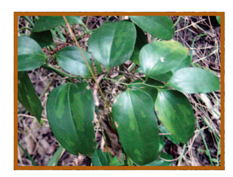
Laurel Greenbriar Smilax laurifolia

shrub or tree; twigs with 2 inch long thorns; yellow summer blooms; seeds in flat bean pods