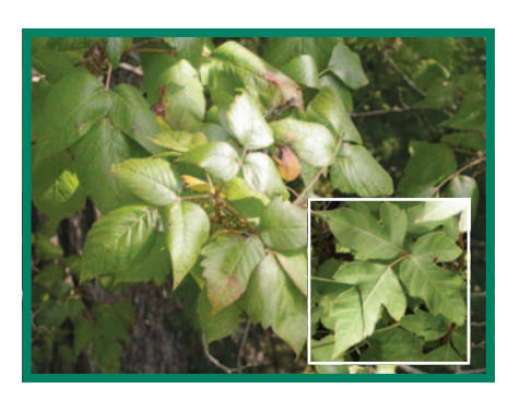
Poison Ivy Rhus toxicodendron

tree; gray bark with conspicuous warty bumps; leaves pale green asymmetrical at base; late-summer orange to brown/red berry