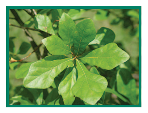
Water Oak Quercus nigra

oak due to leaf shape; leaves vary in shape, often on same branch; usually found in moist to wet soils