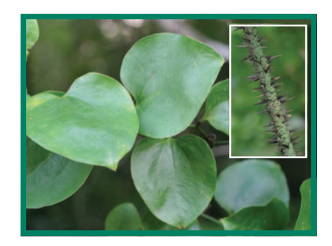
Bristle Greenbriar Smilax hispida

medium-sized tree; also yellowishgreen fleshy fruit on female tree; stems have milky sap