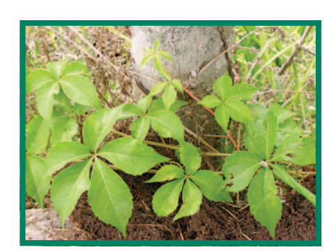
Virginia Creeper Parthenocissus quinquefolia

climbing vine or shrub to 10m; opposite leaves with serrated edge; orange tubular flowers