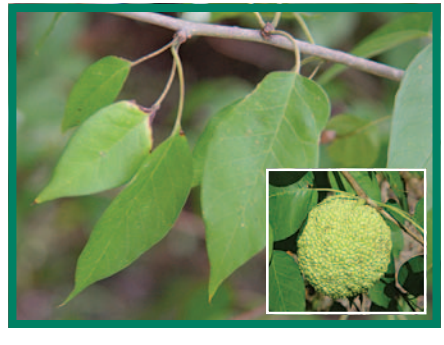
Bois d'arc Maclura pomifera

shrub; opposite deiciduous leaves; orange/brown to gray bark; purple berries in clusters around stem in fall