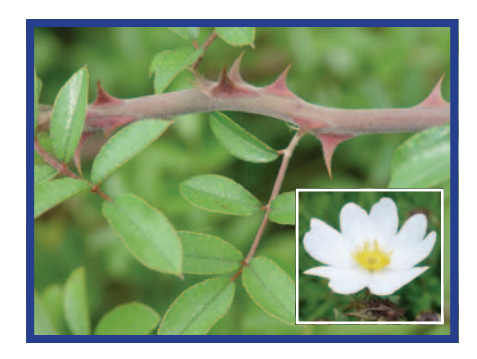
Macartney Rose Rosa bracteata

small to large tree; evergreen; usually oblong-shaped leaves; acorns usually in clusters of 3 to 5