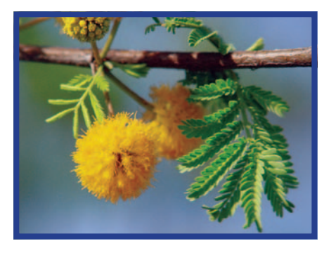
Huisache Acacia farnesiana

small tree; oblong evergreen leaves wedge-shaped at base; bell-shaped white flowers: black berries in winter