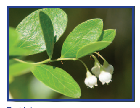
Farkleberry Vaccinium arboreum

prickly vine; 3-5 leaves in cluster; white flowers; black fruit in late spring and summer