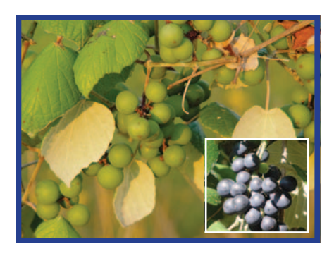
Mustang Grape Vitis mustangensis

thorny evergreen shrub; white flowers in the summer; leaves dark green above, paler and hairy below