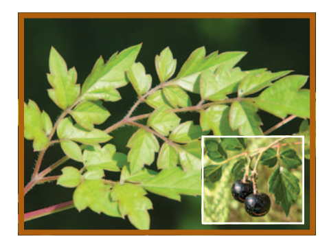
Peppervine Ampelopsis arborea

vine; strong prickles; evergreen leaves leathery green to yellow green above