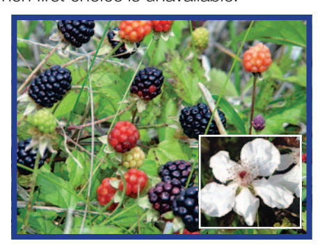
Dewberry species Rubus spp.

small tree; also called woolybucket bumelia and gum elastic; leaves shiny green above, fuzzy or wooly below; thorns