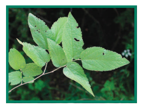
Netleaf Hackberry Celtis laevigata

small tree; many species; twigs usually with slender thorns; scaly gray outer bark, reddish-brown inner bark; spring white flowers