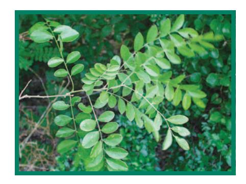
Texas Sophora Sophora affinis

multi-branched small shrub with reddish stems; small leaves often growing beneath larger ones; tiny yellow summer blooms