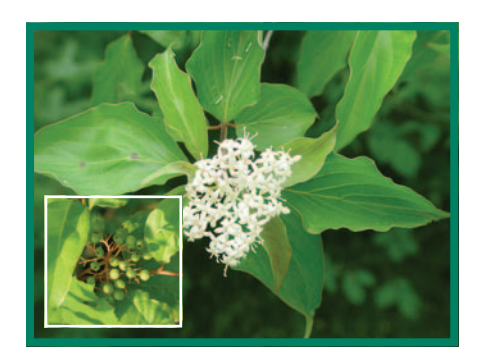
Roughleaf Dogwood Cornus drummondii

can be small shrub or hairystemmed vine; leaf clusters in three; reddish leaf stems; small whitish berries