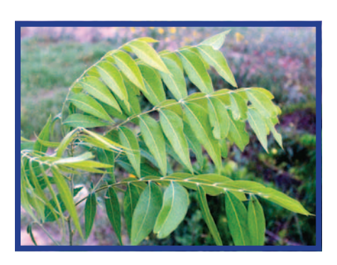
Western Soapberry Sapindus saponaria

tree to 15m; long alternate leaves; gray to red bark may break into reddish scales; yellow grape-like berries in fall