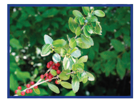
Yaupon Ilex vomitoria

tree to 15m; long alternate leaves; gray to red bark may break into reddish scales; yellow grape-like berries in fall