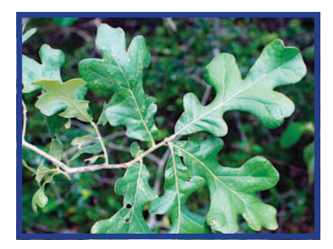
Post Oak Quercus stellata

woody vine; leaves green to graygreen above with fuzzy whitish hairs below; grapes turn dark purple when ripe