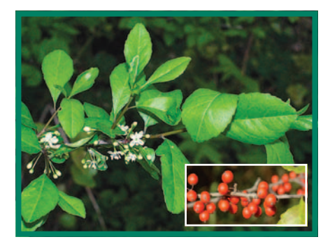
Deciduous Holly llex decidua

tree; leaves with serrated edges and prominent veins below; brown slender twigs, bark sometimes with flattened ridges; winged seeds