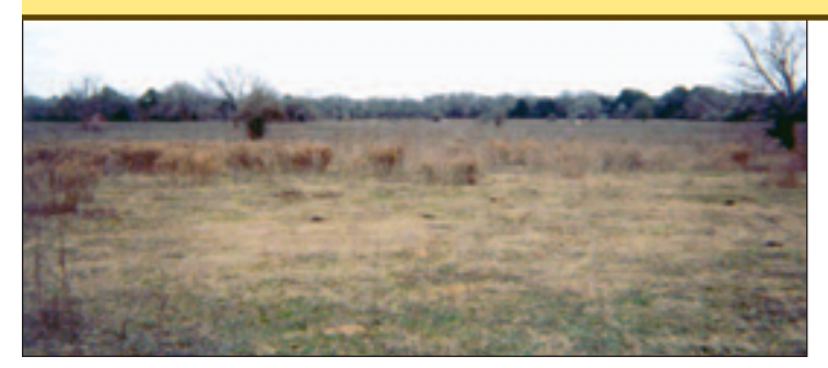
Large central wetland area on ranch in dry conditions in summer 2003.

Large central wetland area in wet conditions in January 2005. This is the same tree that appears in the photo on the facing page.