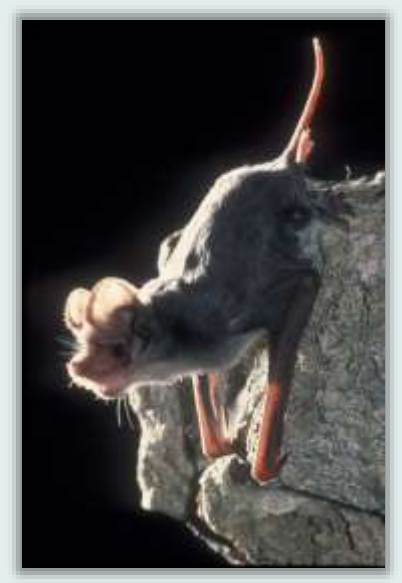
Mexican free-tailed bat

Not to brag or anything, but Texas is home to 32 species of bats, more than any other state. The majority of our bat species feed on insects, except two species that we share with Mexico. The Mexican long-tongued bat