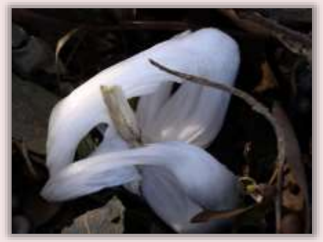
Unique ribbon ice sculptures form during first frost.