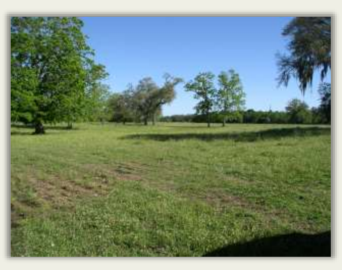
Well-manicured pastures offer very little, if any, benefit to wildlife.

If you are interested in finding out how your property may experience greater plant diversity and the benefits derived from it, please contact your TPWD biologists or local USDA-Natural Resources Conservation Service office. We work together, and through field visits, where we can learn your priorities and conduct inventory and assessments, and thus help you work toward making your place what you want it to be.