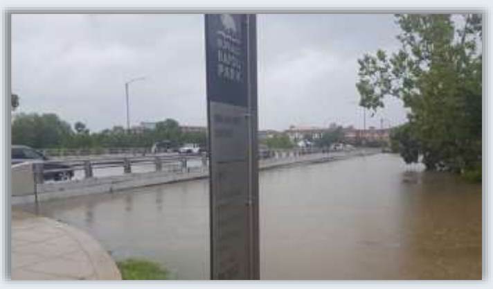
Waugh Drive Bridge was home to 300,000 Mexican Free-tailed bats before Hurricane Harvey. Note the center of the bridge was not submerged at the highest floodstage.

Houston has earned the nickname the "Bayou City" because of the 800 miles of bayous, creeks and streams that meander their way throughout Harris County. Most of these riparian areas are used by wildlife as home and highways crisscrossing the urban jungle. Although it is difficult to measure the effects Harvey had on the wildlife populations of Houston, it is safe to say that many wildlife populations in the area are accustomed to the periodic flooding and were able to seek higher ground and were minimally impacted by the rising water. Although, there are a couple of species that call the urban jungle of Houston home that are currently being monitored.