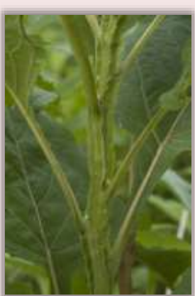
Winged stem of Frostweed.