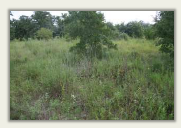
A 'messy-looking' pasture with a diversity of grasses, forbs, and trees will also have a diverse wildlife community.