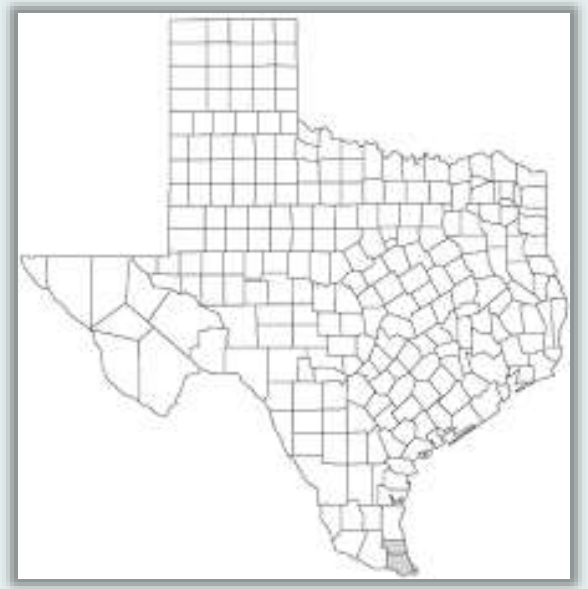
Top: Jauguarundi Bottom: Jaguarundi distribution

6. Try to take a good photo. Almost everyone carries a smart phone with them these days. If the animal pauses long enough, try to take a picture. When taking a picture, do not zoom in, but rather take the picture at normal settings, and zoom in on the computer later. This will help keep the photo from being as pixelated. Try to include size references in the photo, and make a mental note about the time of day you took the picture. All of these can help in trying to figure out what the animal actually was. If you suspect an animal is roaming a certain area, try setting up game cameras along game trails or at nearby water sources.