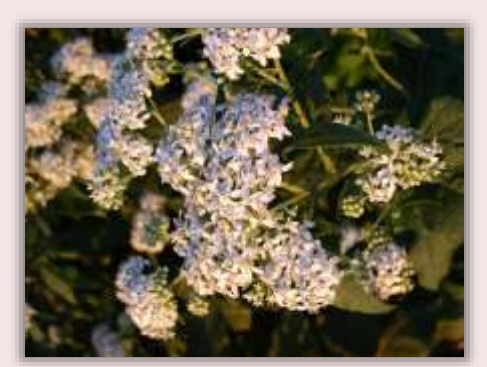
Beautiful white blooms in fall attract pollinators.